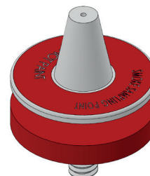
ABS019C/HO CONICAL HEAD M16 Plastic NUT