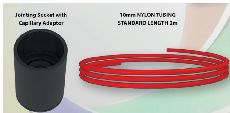
Jointing Socket with Capillary Adaptor